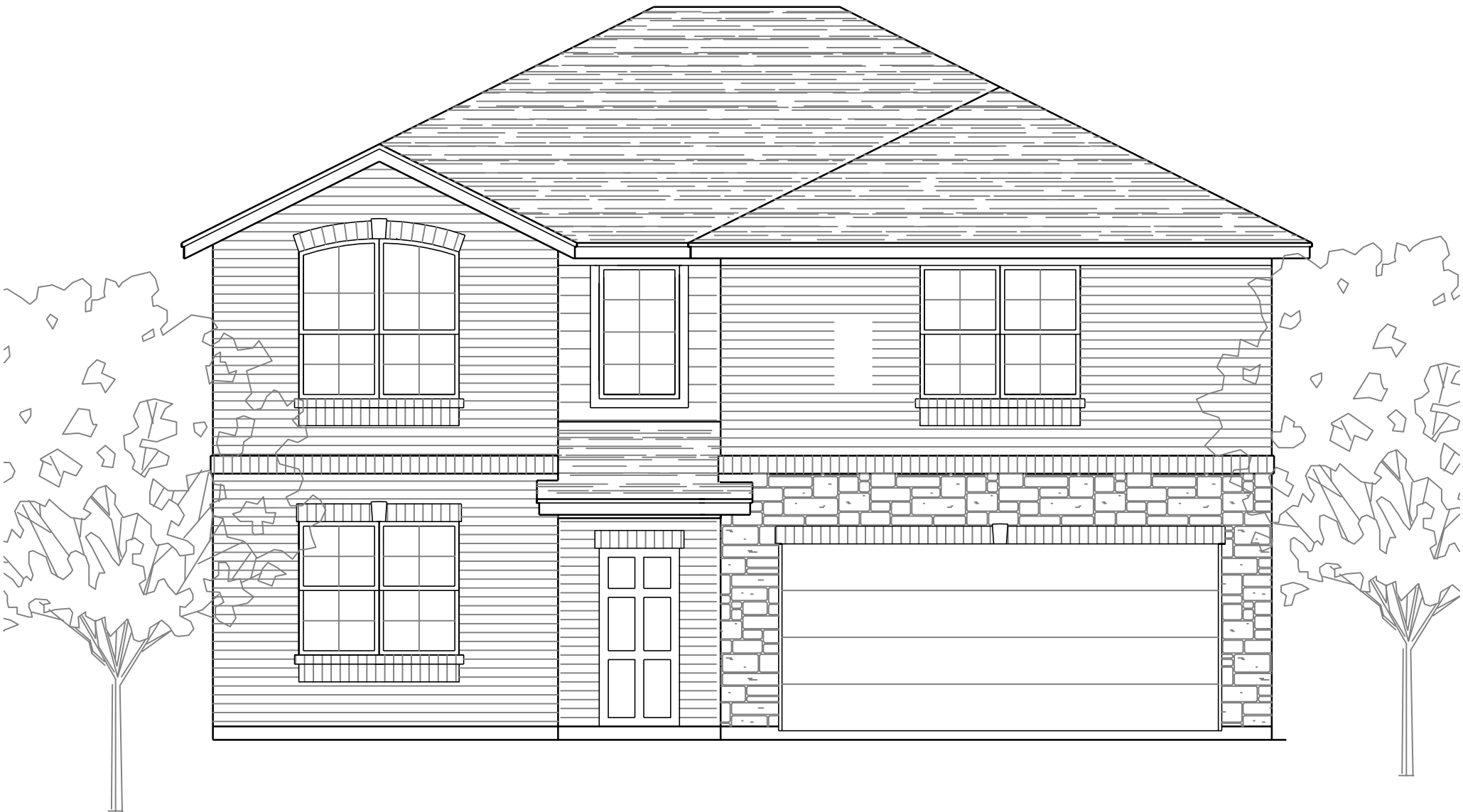
THE 201 FRONT ELEVATION 2400 S.F.